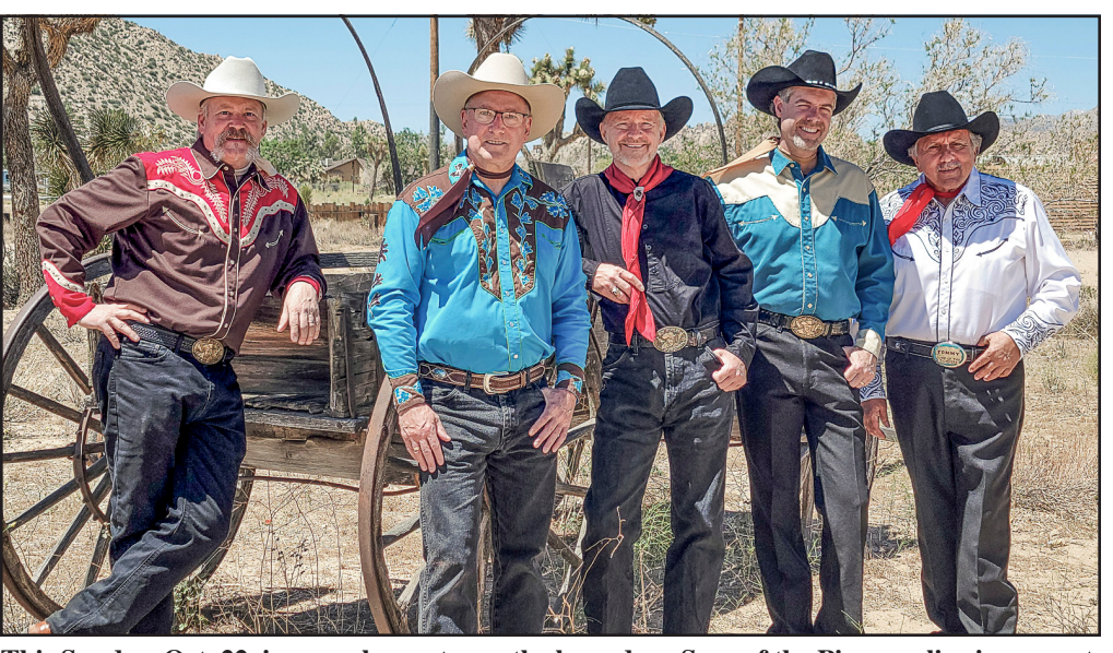
This Sunday, Oct. 22, is your chance to see the legendary Sons of the Pioneers live in concert, all for the worthy cause of raising money for childhood literacy.