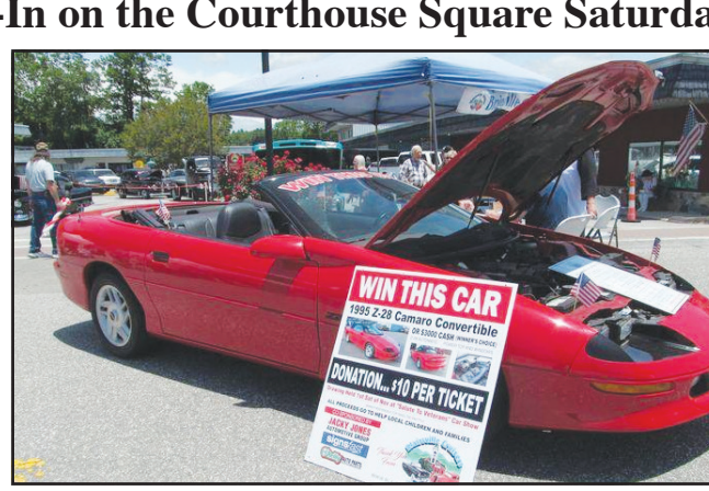
Win this 1995 Camaro Z-28 and help local children in need this Christmas season. Get your donation raffle tickets soon. Drawing is November 4, 2023 at the Salute to Veterans Car Show in Blairsville's Union County Farmers Market.

ville Cruisers Car Club Public Group . Come visit the Historic Courthouse square in Downtown Blairsville Saturday and see some great vehicles.