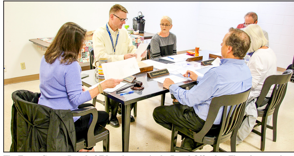
The Towns County Board of Education met in the Board Office last Thursday morning to vote on advertising its 2023 school millage rate.

"There were only six See Millage Rates, Page 6